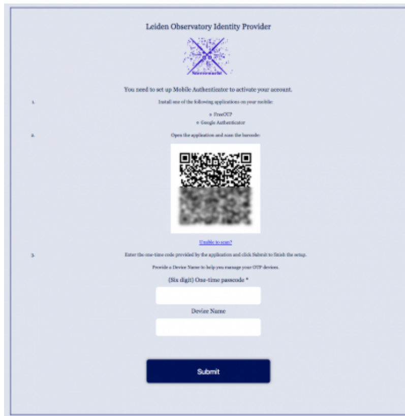
Figure 2: 2FA setup secret key form (Click image to enlarge).

After entering your account credentials you are presented a QR code on the next page. Now use your smart phone APP to scan this QR code. This QR code is in fact your personal secret key, which you are now saving to your smart phone.