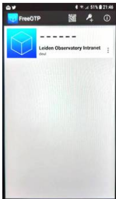
Figure 3: FreeOTP ID block after scanning QR code (Click image to enlarge).

After entering your account credentials you are presented a QR code on the next page. Now use your smart phone APP to scan this QR code. This QR code is in fact your personal secret key, which you are now saving to your smart phone.