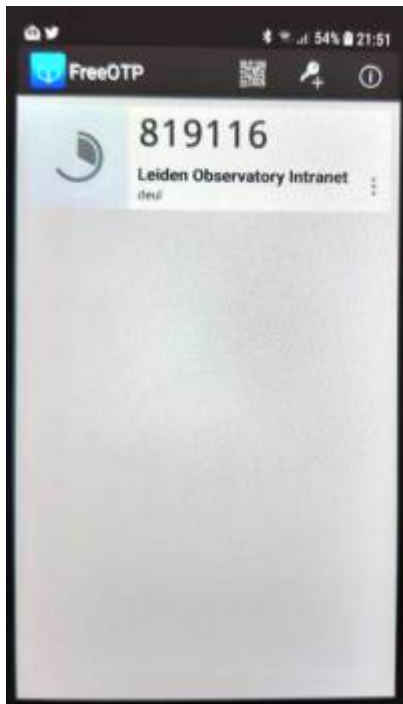
Figure 4: FreeOTP Generated passcode (Click image to enlarge).

To generate a passcode to fill into the WEB page just click the identity block on your smart phone. You are now presented a six digit number. Copy this number to the WEB page. Note that there is a little timer to the left of the passcode. This passcode is valid for the period the timer is shown. This period is 30 seconds. Within this period you must transfer the code to the WEB page and hit the Submit button. If you are too late, the next 30 seconds period start and another passcode is shown.